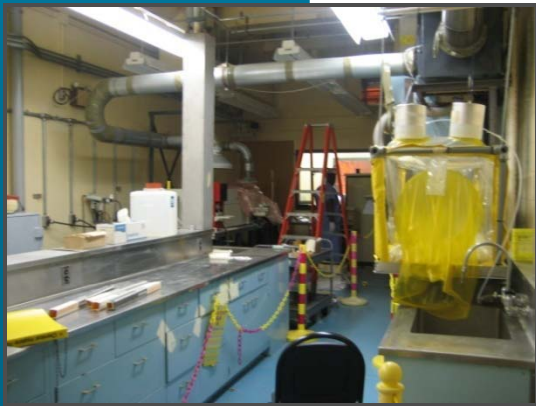
Portsmouth Site Specific Advisory Board